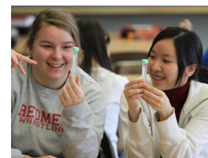
IB Diploma Class of 2012 students in IB Biology examining their DNA extractions!